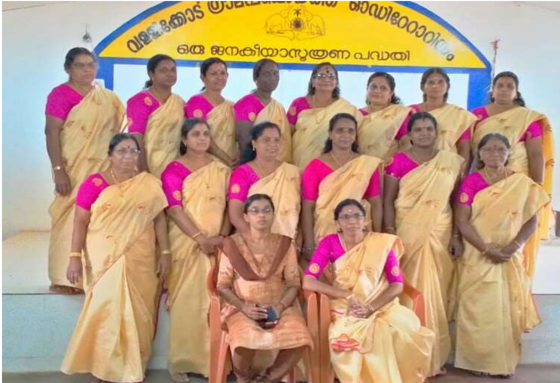
CDS Chairperson with CDS members