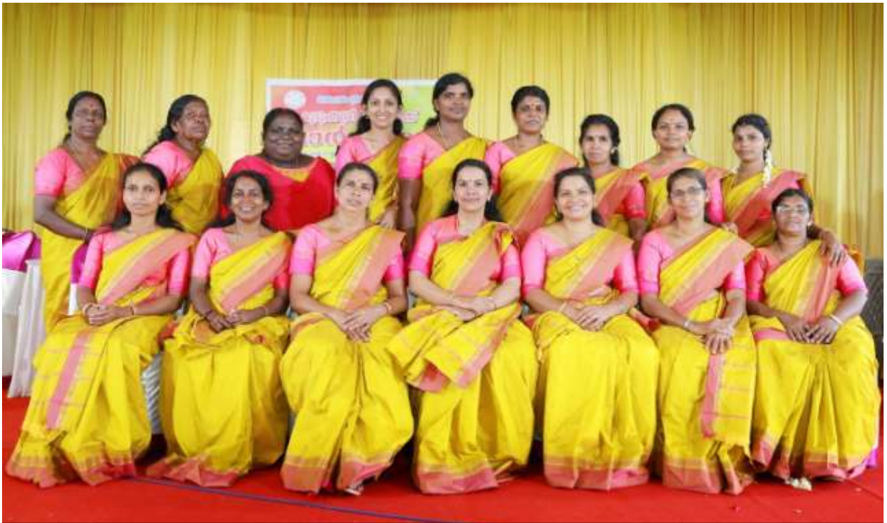
Ramamangalam Grama Panchayath CDS

Kudumbashree Community Development Society (CDS) in Ramamangalam Grama panchayath started in 2003. Since then CDS has been involved in the development of Ramamangalam panchayat. Kudumbashree CDS plays a vital role in the social development, women empowerment, income generation and poverty alleviation of this panchayat. This is a model CDS in Ernakulam District.